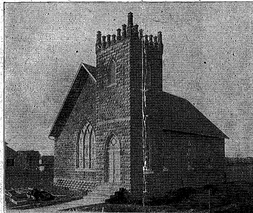
ST. JOHN'S EVANGELICAL LUTHERAN CHURCH INGOMAR, OHIO