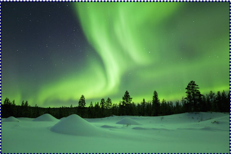
Finland in January!